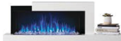
NEFP32-5019W – Cara