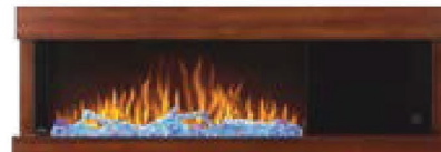
NEFP32-5320BW – Steinfeld