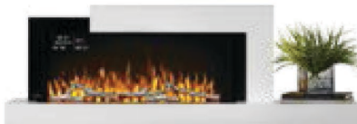
NEFP32-5019W-IOT – Cara Elite