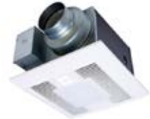
FV-05-11VKL1/ FV-11-15VKL1/ FV-05-11VKS1