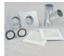
Double Inlet Kit

*Special order item (6 – 8 week delivery).