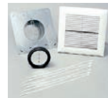
Single Inlet Kit