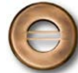
2" Vent Plate