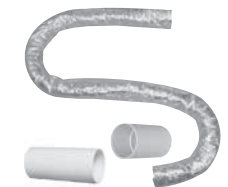
Unassembled Flex Duct

NOTE: 2" AFD (Assembled Flex Duct) includes 10' or 15' of flexible duct as specified plus one foot, two Branch Couplers attached, one Branch Take-Off with Gasket assembly, one Rough-In Kit, one Rough-In Cap, and one Plastic Vent Plate. 2" UFD (Unassembled Flex Duct) includes 25' of flexible duct, one 2" UFD Kit (3 Branch Connector Tubes, 6 Branch Couplers and 6 Tie Wraps).