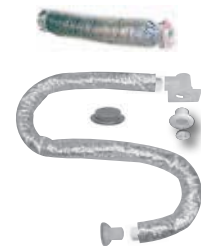
Assembled Flex Duct